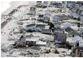
Aftermath of Hurricane Sandy